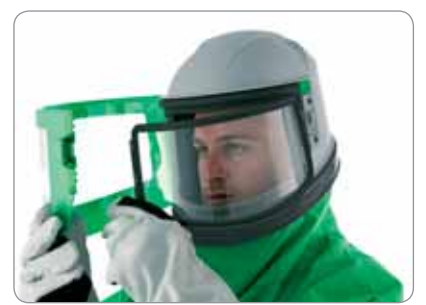
Tear off visor tabs with gloved hands