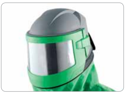
Optimum downward and peripheral vision

When you are not blasting you are not making money, that's why the Nova 3® has individually pre-folded visor tabs ensuring you tear off only one lens at a time, saving up to 45 minutes per day, per blaster.