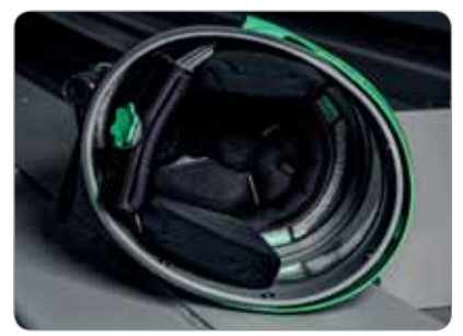
Adjustable inner padding creates a custom fit